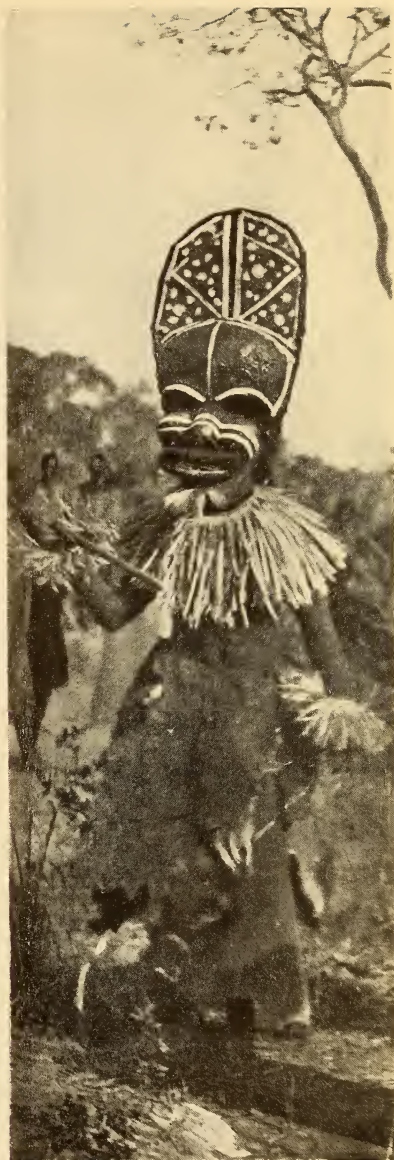
A FETISH MAN

A Mashukalumpe man. Near the Kafukwe River, upper N.W. Rhodesia.